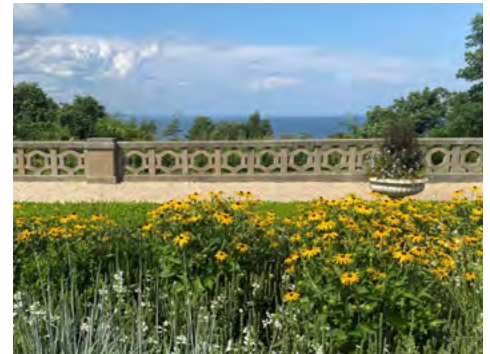
Sustainable gardens behind Hempstead House

"Falaise" is French for "cliff," which is apropos because the mansion was built on a cliff overlooking the Long Island Sound. Charles Lindbergh was a good friend of Harry's, visiting Falaise often. He wrote much of his pivotal memoir, "We" at Falaise, pages of which are on display at the museum today (as is Lindbergh's 1968 Ford Falcon station wagon). Unfortunately, Lindbergh became a Nazi sympathizer during World War II, leading Harry to end their friendship.