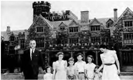
British refugee children at Hempstead House